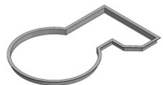
Underground template to create a flush operation surface