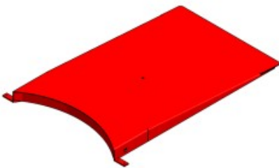
Loading ramp for pallet jack

Carriage with continuous-change electronic motor driven pre-stretch, adjustable through the panel. Film is dispensed automatically, electronically assisted, at variable speed depending on request. Pre-stretch configuration up to 300%.