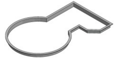
Underground template to create a flush operation surface